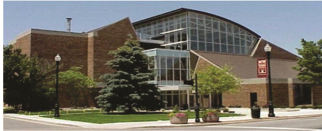
Wood County District Public Library